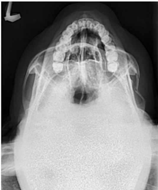
Fig. 1: Pre operative radiograph

myeloproliferation. Because RBCs are produced in excess in the bone marrow compared to white blood cells and platelets an abnormally high number of RBCs circulate in the blood, 1 resulting in hyper viscosity and a greater risk for thrombosis. 1 Due to the built-in thrombogenic potential of the blood, there is an increased risk of myocardial infarction, heart attack, cerebrovascular events, pulmonary infarctions, deep vein thrombosis, and portal hypertension. Perioperative monitoring of these patients is essential to avoid complications. To avoid complications, it is important to consider prophylactic procedures before surgery. 3 Therapeutic phlebotomy, hemodilution, and antiplatelet therapy are suggested and mostly used as prophylactic procedures recommended during the perioperative period. The primary outcomes considered in the management are to enhance the health benefits 1 while minimizing negative effects by encouraging procedures 1 to be performed at appropriate times with appropriate precautions. 1