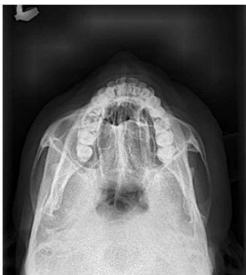
Fig. 2: Post operative radiograph

to reach the zygomatic arch. The Rowe Zygomatic elevator was passed under the zygomatic arch, and the arch was elevated. A mouth opening of 5 cm was achieved and the stability of the reduced arch was checked using extraoral digital pressure. The incision was closed with 3-0 vicryl round body absorbable sutures. The reduction was confirmed by radiograph (SMV) (Fig. 2) and compared with the preoperative radiograph.